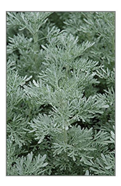
Parfum d'Ethiopia Artemisia foliage