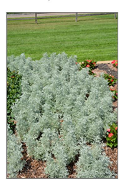
Parfum d'Ethiopia Artemisia