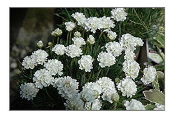
Cotton Tail Sea Thrift flowers