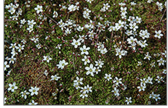
Corsican Sandwort flowers