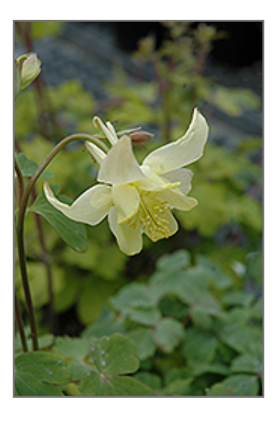
Origami Yellow Columbine flowers

Origami Yellow Columbine is recommended for the following landscape applications;