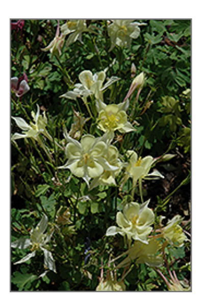
Origami Yellow Columbine flowers