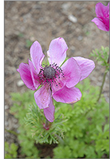
Sylphide Grecian Windflower flowers