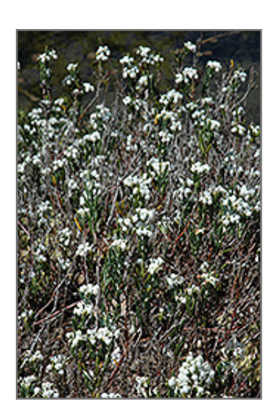
Alba Bog Rosemary flowers

Alba Bog Rosemary will grow to be only 6 inches tall at maturity, with a spread of 8 inches. It tends to fill out right to the ground and therefore doesn't necessarily require facer plants in front. It grows at a slow rate, and under ideal conditions can be expected to live for approximately 20 years.