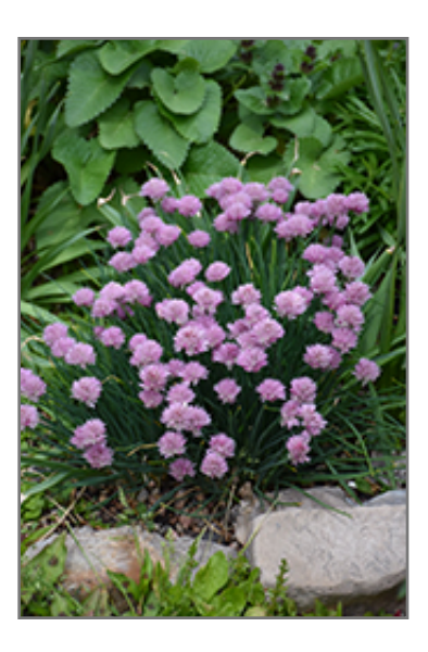
Forescate Chives in bloom

Forescate Chives is recommended for the following landscape applications;