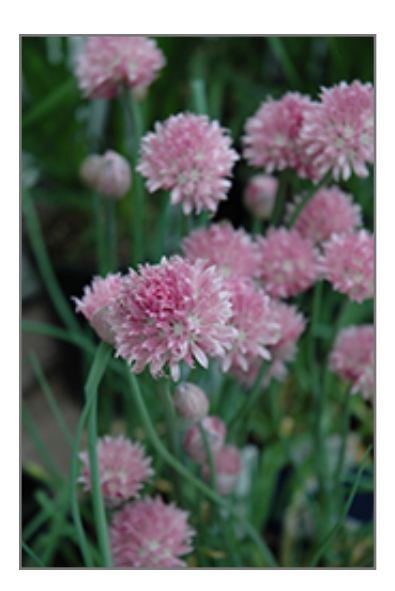
Forescate Chives flowers