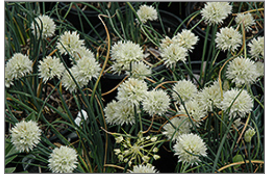
Max Alba Allium flowers

Other Names: Ornamental Onion, Flowering Onion