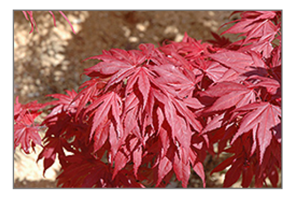
Oregon Sunset Japanese Maple foliage