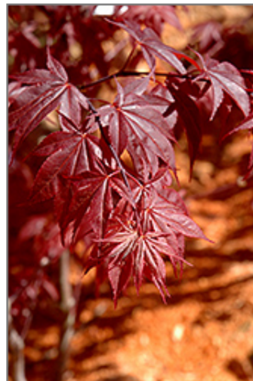
Glowing Embers Japanese Maple foliage