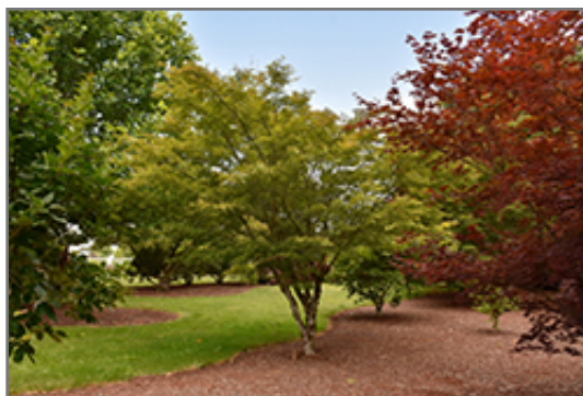
Glowing Embers Japanese Maple