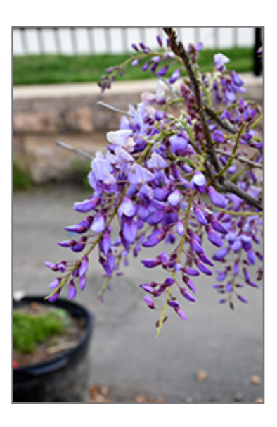
Caroline Chinese Wisteria flowers

Caroline Chinese Wisteria is covered in stunning chains of fragrant lilac purple pea-like flowers with blue overtones hanging below the branches from mid to late spring, which emerge from distinctive deep purple flower buds. It has green deciduous foliage which emerges grayish green in spring. The narrow pinnately compound leaves turn yellow in fall.