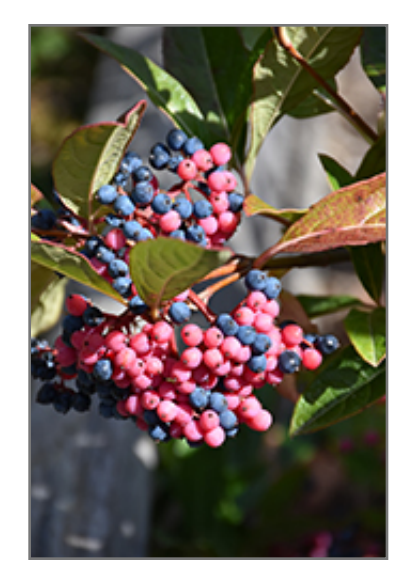
Brandywine Viburnum fruit

Brandywine Viburnum is recommended for the following landscape applications;