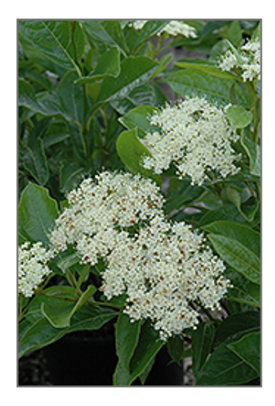
Brandywine Viburnum flowers