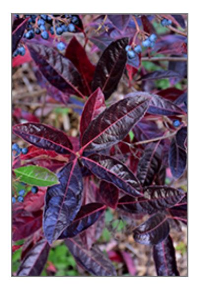
Brandywine Viburnum in fall

This shrub does best in full sun to partial shade. It prefers to grow in average to moist conditions, and shouldn't be allowed to dry out. It is not particular as to soil type or pH. It is highly tolerant of urban pollution and will even thrive in inner city environments. Consider applying a thick mulch around the root zone in winter to protect it in exposed locations or colder microclimates. This is a selection of a native North American species.