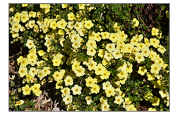
Primrose Beauty Potentilla flowers

Primrose Beauty Potentilla will grow to be about 3 feet tall at maturity, with a spread of 4 feet. It tends to fill out right to the ground and therefore doesn't necessarily require facer plants in front. It grows at a slow rate, and under ideal conditions can be expected to live for approximately 30 years.