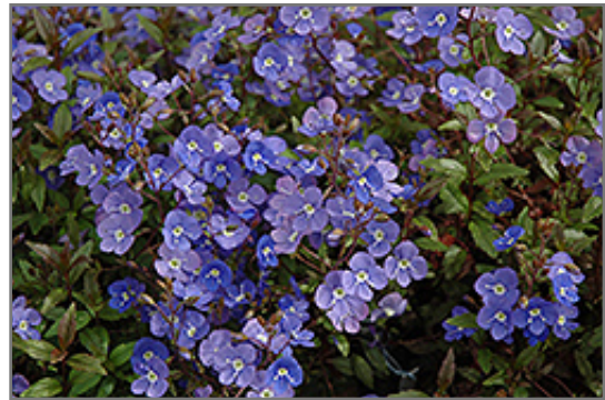
Georgia Blue Speedwell flowers

Georgia Blue Speedwell is recommended for the following landscape applications;