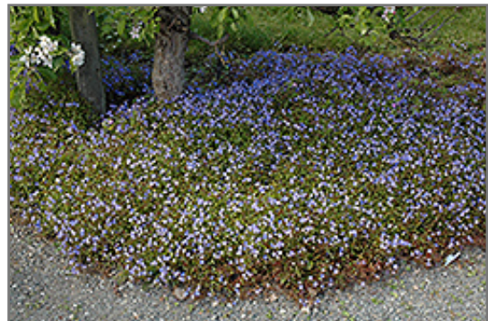
Georgia Blue Speedwell in bloom