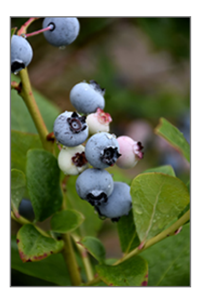
Spartan Blueberry fruit

Spartan Blueberry features dainty clusters of white bell-shaped flowers hanging below the branches in mid spring, which emerge from distinctive red flower buds. It has green deciduous foliage. The glossy oval leaves turn an outstanding orange in the fall. It features an abundance of magnificent blue berries in early summer. The smooth tan bark adds an interesting dimension to the landscape.