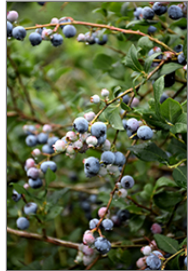
Jubilee Blueberry fruit

Jubilee Blueberry is a multi-stemmed deciduous shrub with an upright spreading habit of growth. Its average texture blends into the landscape, but can be balanced by one or two finer or coarser trees or shrubs for an effective composition.