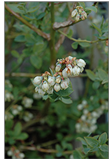
Jubilee Blueberry flowers