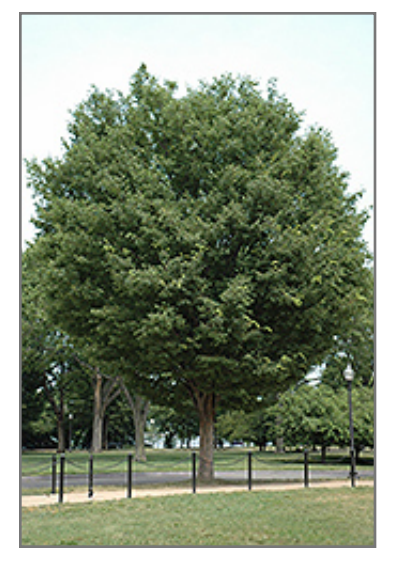
Bosque Elm

Bosque Elm is recommended for the following landscape applications;