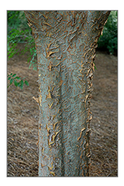
Bosque Elm bark