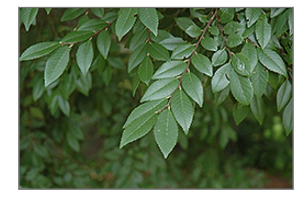
Bosque Elm foliage

This tree should only be grown in full sunlight. It is very adaptable to both dry and moist locations, and should do just fine under average home landscape conditions. It is not particular as to soil type or pH, and is able to handle environmental salt. It is highly tolerant of urban pollution and will even thrive in inner city environments. This is a selected variety of a species not originally from North America.