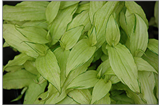
Lightning StrikeToad Lily foliage