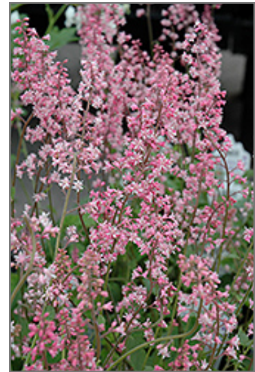
Oakleaf Foamflower flowers

Lush green oakleaf shaped foliage form a neat mound; pink flower buds open to reveal the foamy shell pink and white flowers on graceful spikes; dramatic foliage, shade tolerance and repeat flowering make this one a winner