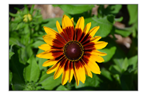
Denver Daisy Coneflower flowers

Denver Daisy Coneflower is an herbaceous perennial with an upright spreading habit of growth. Its medium texture blends into the garden, but can always be balanced by a couple of finer or coarser plants for an effective composition.