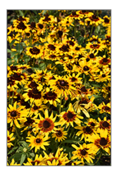
Denver Daisy Coneflower flowers

Denver Daisy Coneflower is a fine choice for the garden, but it is also a good selection for planting in outdoor pots and containers. With its upright habit of growth, it is best suited for use as a 'thriller' in the 'spiller-thriller' container combination; plant it near the center of the pot, surrounded by smaller plants and those that spill over the edges. Note that when growing plants in outdoor containers and baskets, they may require more frequent waterings than they would in the yard or garden. Be aware that in our climate, most plants cannot be expected to survive the winter if left in containers outdoors, and this plant is no exception. Contact our experts for more information on how to protect it over the winter months.