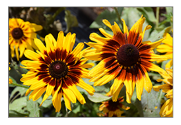
Denver Daisy Coneflower flowers