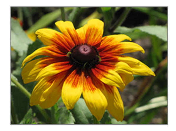
Cappuccino Coneflower flowers

Cappuccino Coneflower is recommended for the following landscape applications;