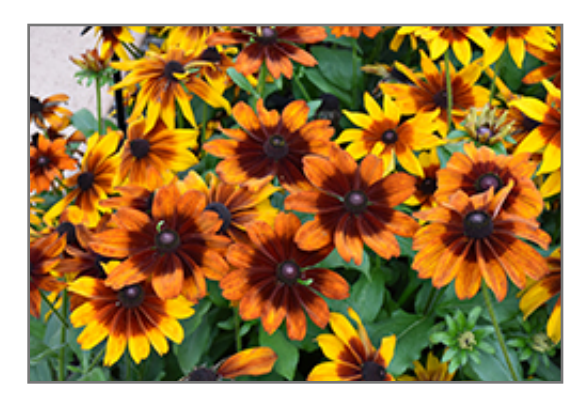
Cappuccino Coneflower flowers