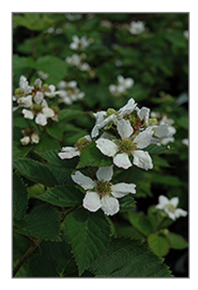
Triple Crown Blackberry flowers

A thornless variety producing juicy crops through midsummer; blackberries are quite shrubby looking and require careful placement in the landscape, a specific pruning regimen and protection from birds