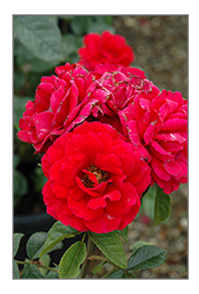
Stairway To Heaven Rose flowers