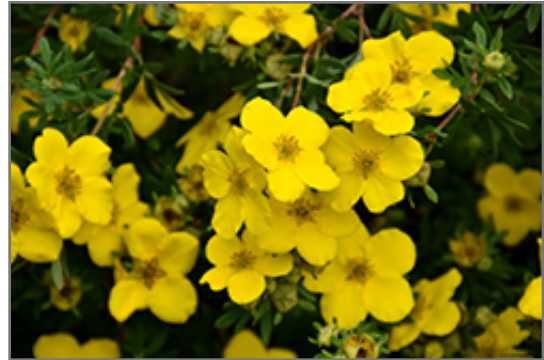
Gold Star Potentilla flowers