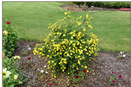
Gold Star Potentilla in bloom