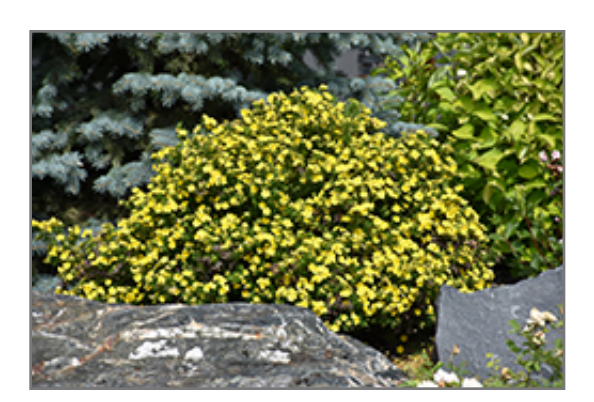
Gold Drop Potentilla in bloom

Gold Drop Potentilla is recommended for the following landscape applications;