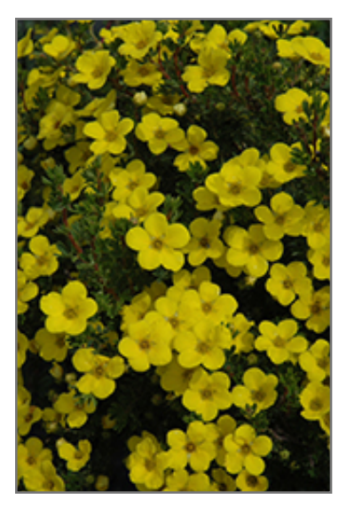
Gold Drop Potentilla flowers

This is a relatively low maintenance shrub, and is best pruned in late winter once the threat of extreme cold has passed. It is a good choice for attracting butterflies to your yard, but is not particularly attractive to deer who tend to leave it alone in favor of tastier treats. It has no significant negative characteristics.