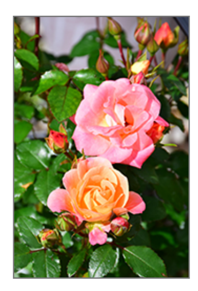
Peach Drift Rose flowers