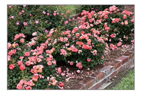
Peach Drift Rose in bloom

Peach Drift Rose will grow to be about 18 inches tall at maturity, with a spread of 24 inches. It tends to fill out right to the ground and therefore doesn't necessarily require facer plants in front. It grows at a fast rate, and under ideal conditions can be expected to live for approximately 20 years.