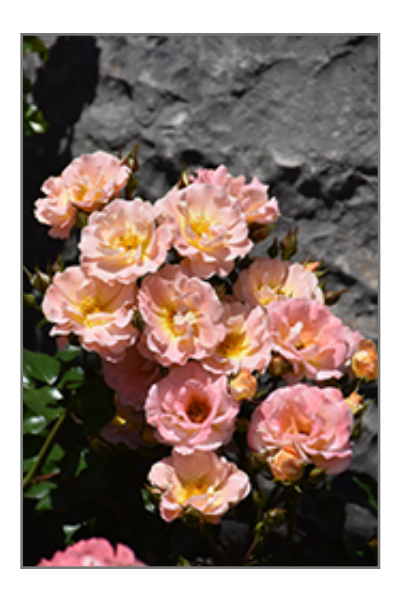
Peach Drift Rose flowers