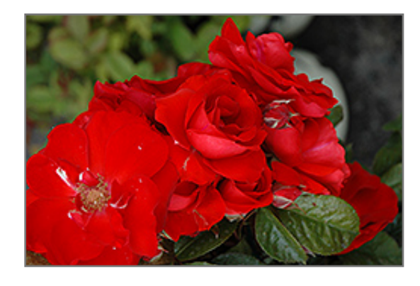
Orange Crush Rose flowers