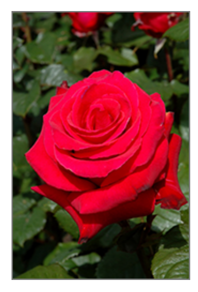
Let Freedom Ring Rose flowers

Let Freedom Ring Rose is recommended for the following landscape applications;