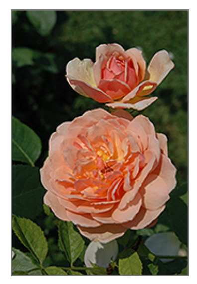
Grace Rose flowers