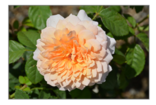
Grace Rose flowers

This is a high maintenance shrub that will require regular care and upkeep, and is best pruned in late winter once the threat of extreme cold has passed. Gardeners should be aware of the following characteristic(s) that may warrant special consideration;