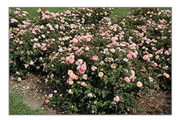
Apricot Drift Rose in bloom

Apricot Drift Rose is recommended for the following landscape applications;