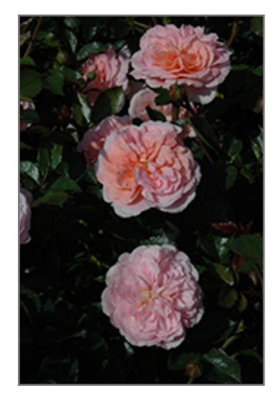
Apricot Drift Rose flowers

This shrub will require occasional maintenance and upkeep, and is best pruned in late winter once the threat of extreme cold has passed. It is a good choice for attracting bees to your yard. It has no significant negative characteristics.