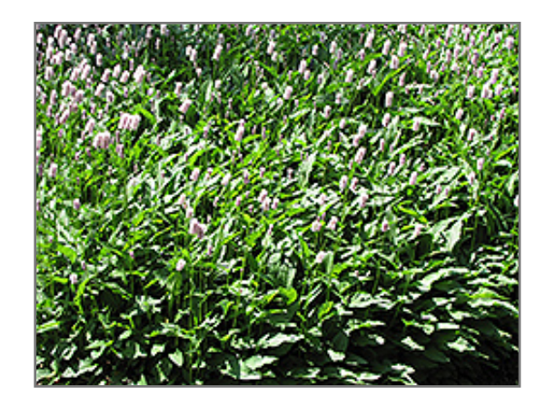
Pink Snakeweed in bloom