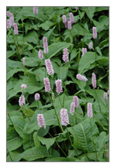
Pink Snakeweed flowers

This plant will require occasional maintenance and upkeep, and is best cleaned up in early spring before it resumes active growth for the season. Gardeners should be aware of the following characteristic(s) that may warrant special consideration;