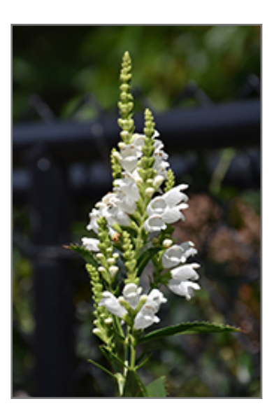
Crystal Peak White Obedient Plant flowers

Crystal Peak White Obedient Plant is recommended for the following landscape applications;