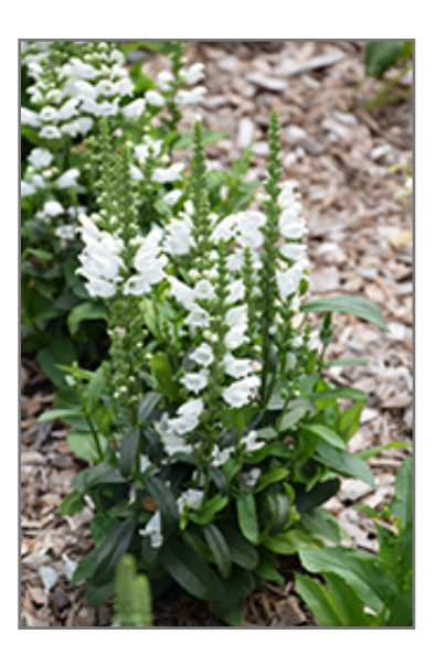
Crystal Peak White Obedient Plant in bloom