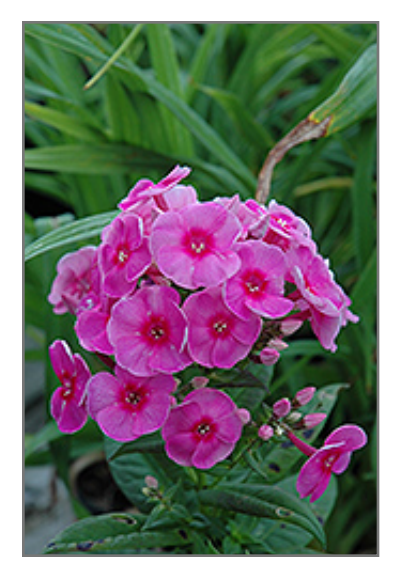
Cosmopolitan Garden Phlox flowers

Elegant summer blooms of fragrant deep pink flowers with red centres, on compact plants suitable for containers or small perennial borders; good mildew resistance