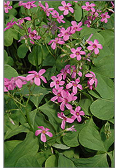
Pink Wood Sorrel flowers