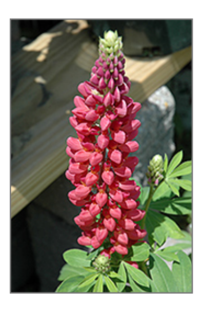
Tutti Frutti Lupine flowers

A stunning dwarf hybrid producing thick spikes of flowers with a wide color range, from yellow, pink, purple, blue and white; a tremendous visual impact massed in the garden, border plantings or in containers