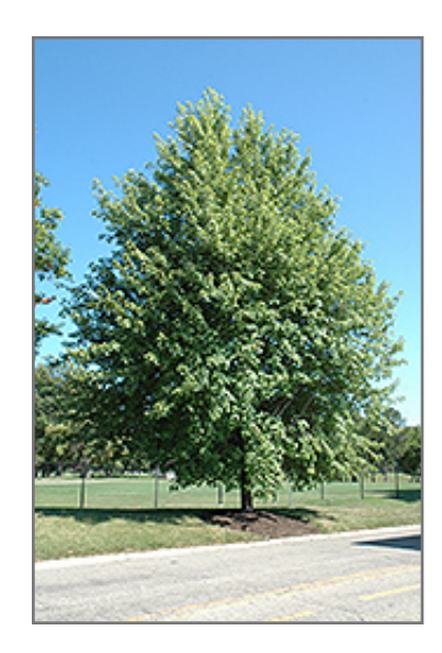
Autumn Fantasy Maple