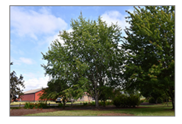
Autumn Fantasy Maple

This tree should only be grown in full sunlight. It is quite adaptable, prefering to grow in average to wet conditions, and will even tolerate some standing water. It is not particular as to soil type or pH. It is highly tolerant of urban pollution and will even thrive in inner city environments. This particular variety is an interspecific hybrid.