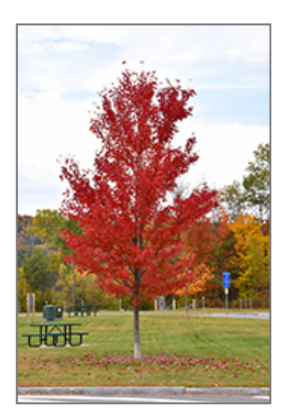
Autumn Fantasy Maple in fall