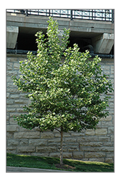
Yarwood London Planetree