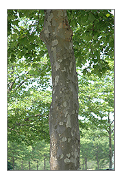
Yarwood London Planetree bark