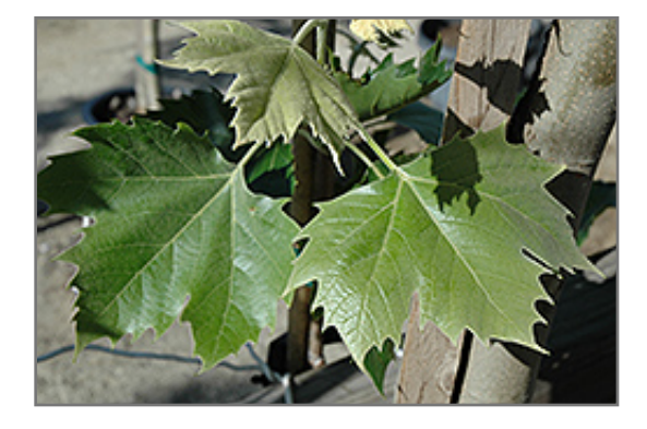
Yarwood London Planetree foliage

Yarwood London Planetree will grow to be about 90 feet tall at maturity, with a spread of 70 feet. It has a high canopy of foliage that sits well above the ground, and should not be planted underneath power lines. As it matures, the lower branches of this tree can be strategically removed to create a high enough canopy to support unobstructed human traffic underneath. It grows at a medium rate, and under ideal conditions can be expected to live to a ripe old age of 100 years or more; think of this as a heritage tree for future generations!