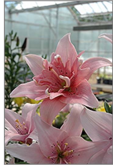
Elodie Lily flowers