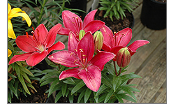
Buzzer Lily flowers