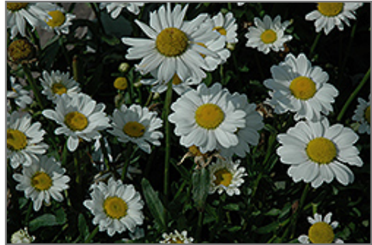
May Queen Shasta Daisy flowers