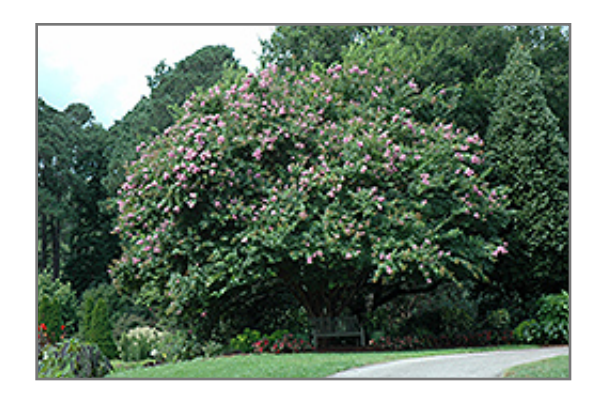
Muskogee Crapemyrtle in bloom