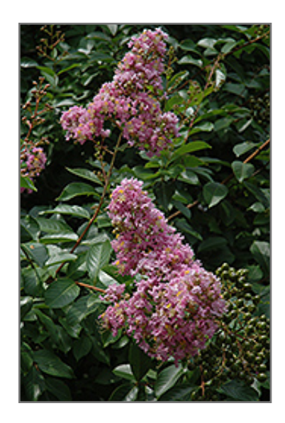
Muskogee Crapemyrtle flowers