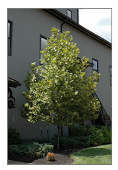
Columbia London Planetree