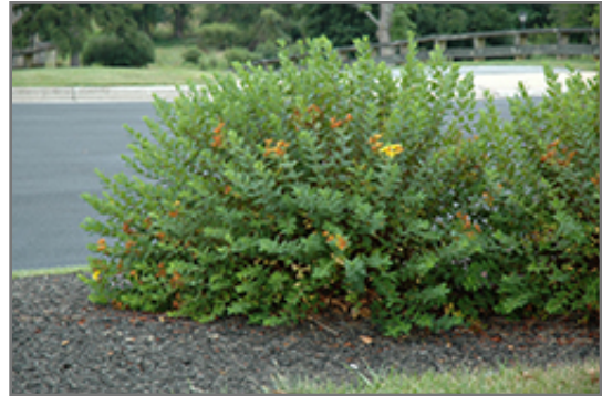
Hidcote St. John's Wort

Hidcote St. John's Wort makes a fine choice for the outdoor landscape, but it is also well-suited for use in outdoor pots and containers. With its upright habit of growth, it is best suited for use as a 'thriller' in the 'spiller-thriller-filler' container combination; plant it near the center of the pot, surrounded by smaller plants and those that spill over the edges. It is even sizeable enough that it can be grown alone in a suitable container. Note that when grown in a container, it may not perform exactly as indicated on the tag - this is to be expected. Also note that when growing plants in outdoor containers and baskets, they may require more frequent waterings than they would in the yard or garden. Be aware that in our climate, most plants cannot be expected to survive the winter if left in containers outdoors, and this plant is no exception. Contact our experts for more information on how to protect it over the winter months.