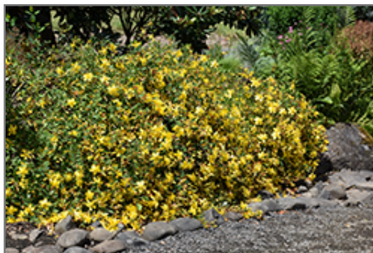
Hidcote St. John's Wort in bloom