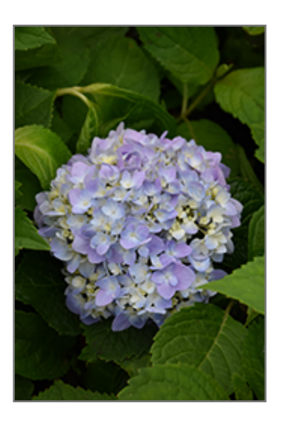
Let's Dance Moonlight Hydrangea flowers

Let's Dance Moonlight Hydrangea is recommended for the following landscape applications;