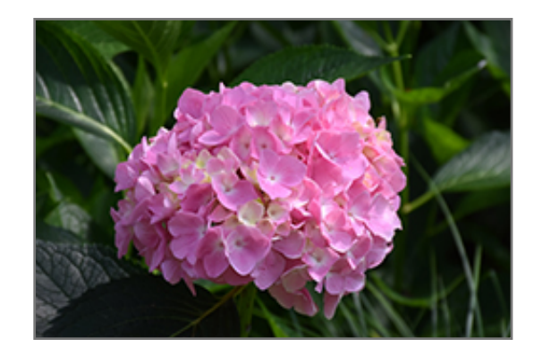
Let's Dance Moonlight Hydrangea flowers

This shrub will require occasional maintenance and upkeep, and should only be pruned after flowering to avoid removing any of the current season's flowers. It has no significant negative characteristics.