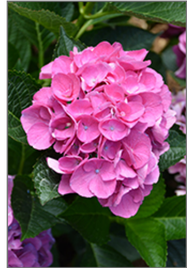
Cityline Vienna Hydrangea flowers