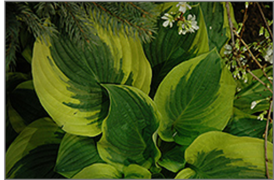
Leola Fraim Hosta foliage

Leola Fraim Hosta is recommended for the following landscape applications;