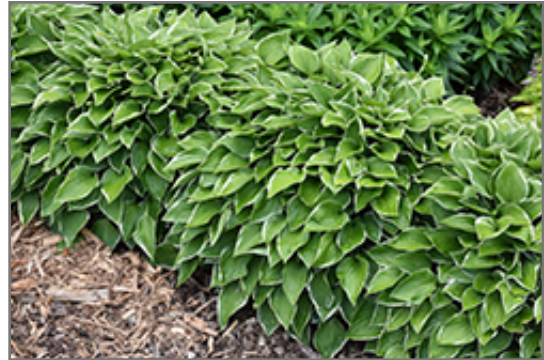
Allan P. McConnell Hosta

Allan P. McConnell Hosta is recommended for the following landscape applications;