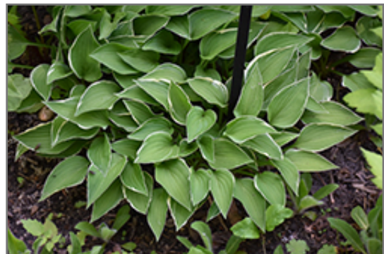
Allan P. McConnell Hosta foliage