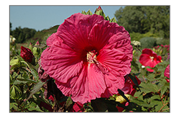
Snowflame Hibiscus flowers