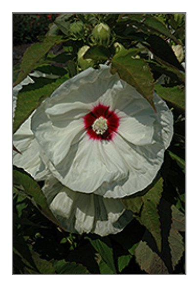
Lou Emmonds Hibiscus flowers

A stunning bold garden accent with giant snow-white flowers marked with a brilliant red blotch in the center, sure to grab attention from a distance; large plant can grow tall, leave adequate room in the garden, makes a wonderful feature perennial