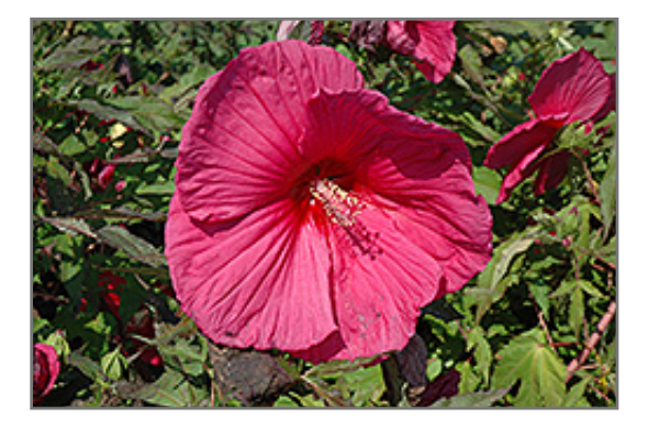
Eruption Hibiscus flowers

Other Names: Rose Mallow, Hardy Hibiscus